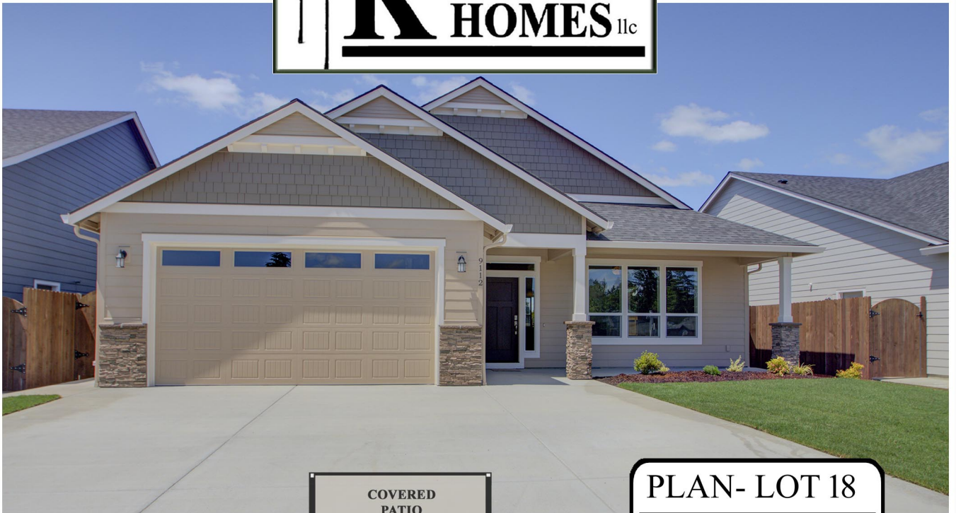
PLAN- LOT 18 MAIN FLOOR- 2001 SF