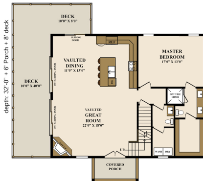
width: 40'-0" + 10' deck MAIN LEVEL FLOOR PLAN